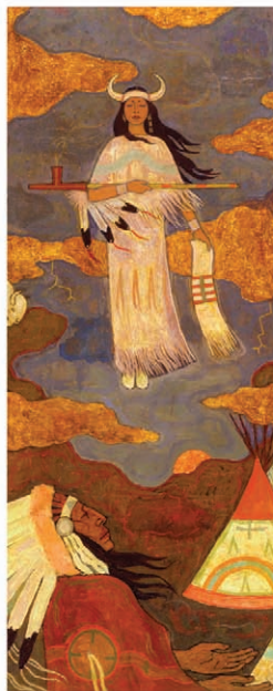
The White Buffalo Calf Woman bringing the Sacred Pipe, by Fritjof Schuon, 1999