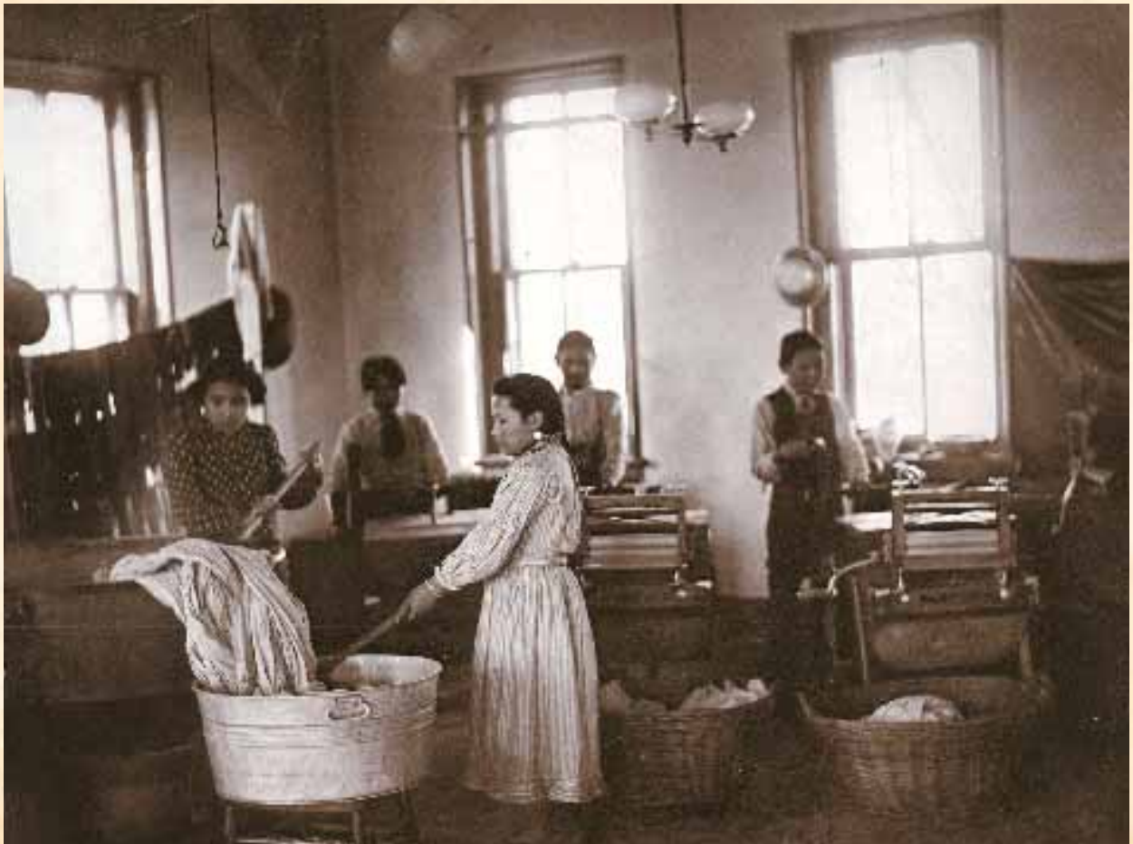
Laundry at the Crow Boarding School, Pryor, Montana