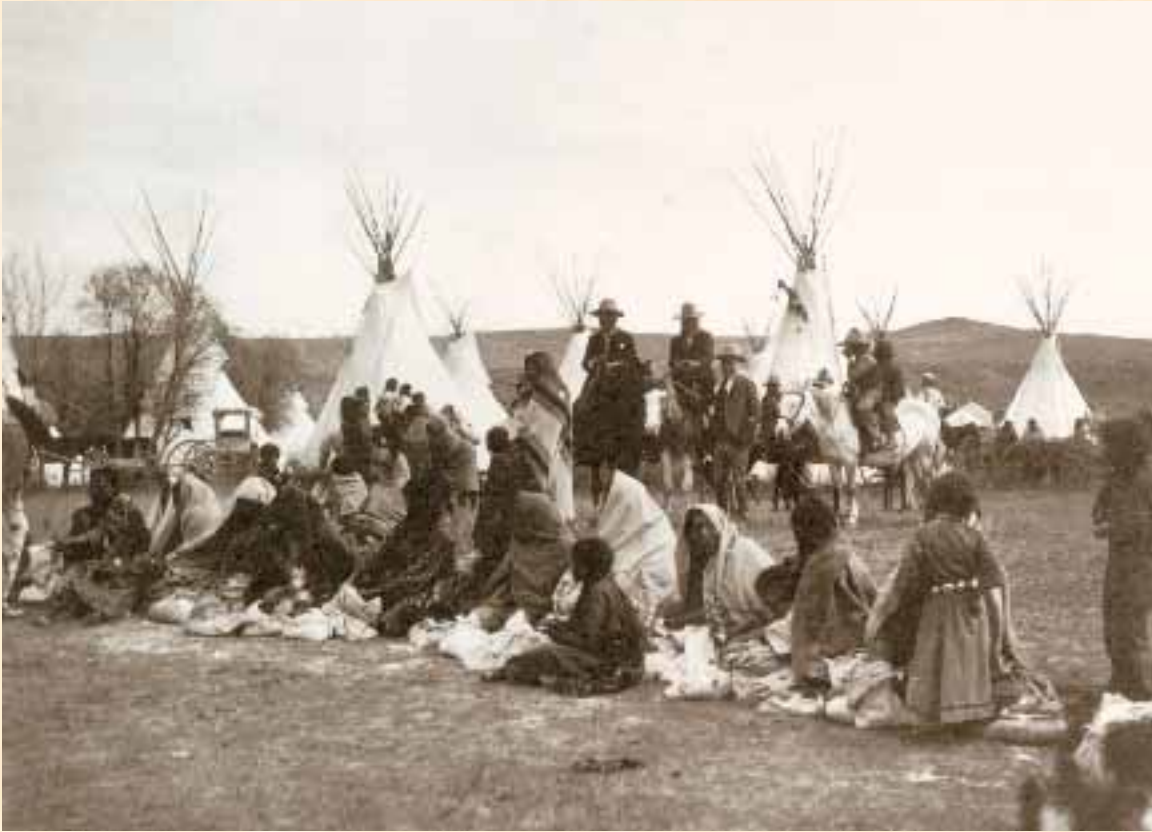
Waiting for rations, c. 1905