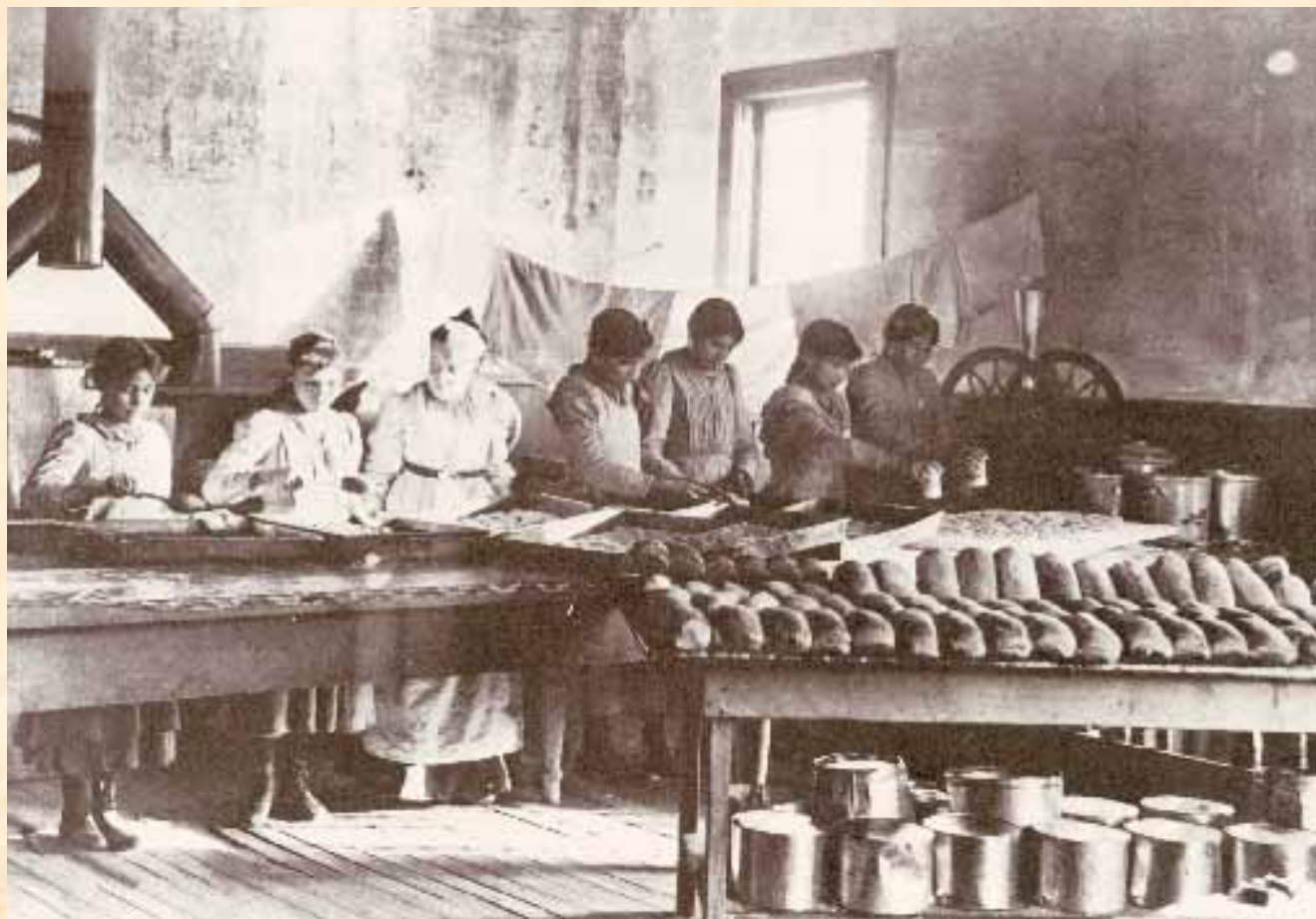
Baking bread at the Willow Creek Boarding School, c. 1907

Over time, however, the parochial schools moved in. The first one was set up by the Catholics over at St. Xavier. Then in 1904 the Baptist people were asked to come and start a church and school. President Grant asked the denominations to help assimilate the Indians and the churches actively tried to convert the Indians away from their traditional ceremonials. Then almost every Christian denomination opened churches and schools on the reservation. The church schools taught the kids how to read and write; at the government schools the education didn't go past the sixth grade—they just stopped there and repeated the sixth grade, so even when they finished government boarding school the children could barely read and write. And, at the church schools they didn't mistreat the children like they did at the government boarding schools. So families sent their children to the church schools instead of the government boarding school. By about 1922 the government boarding school at Crow Agency closed because all of the children were sent by their families to the church schools. The government thought that if the Indians became Christians then they would turn away from their Crow traditions, and,