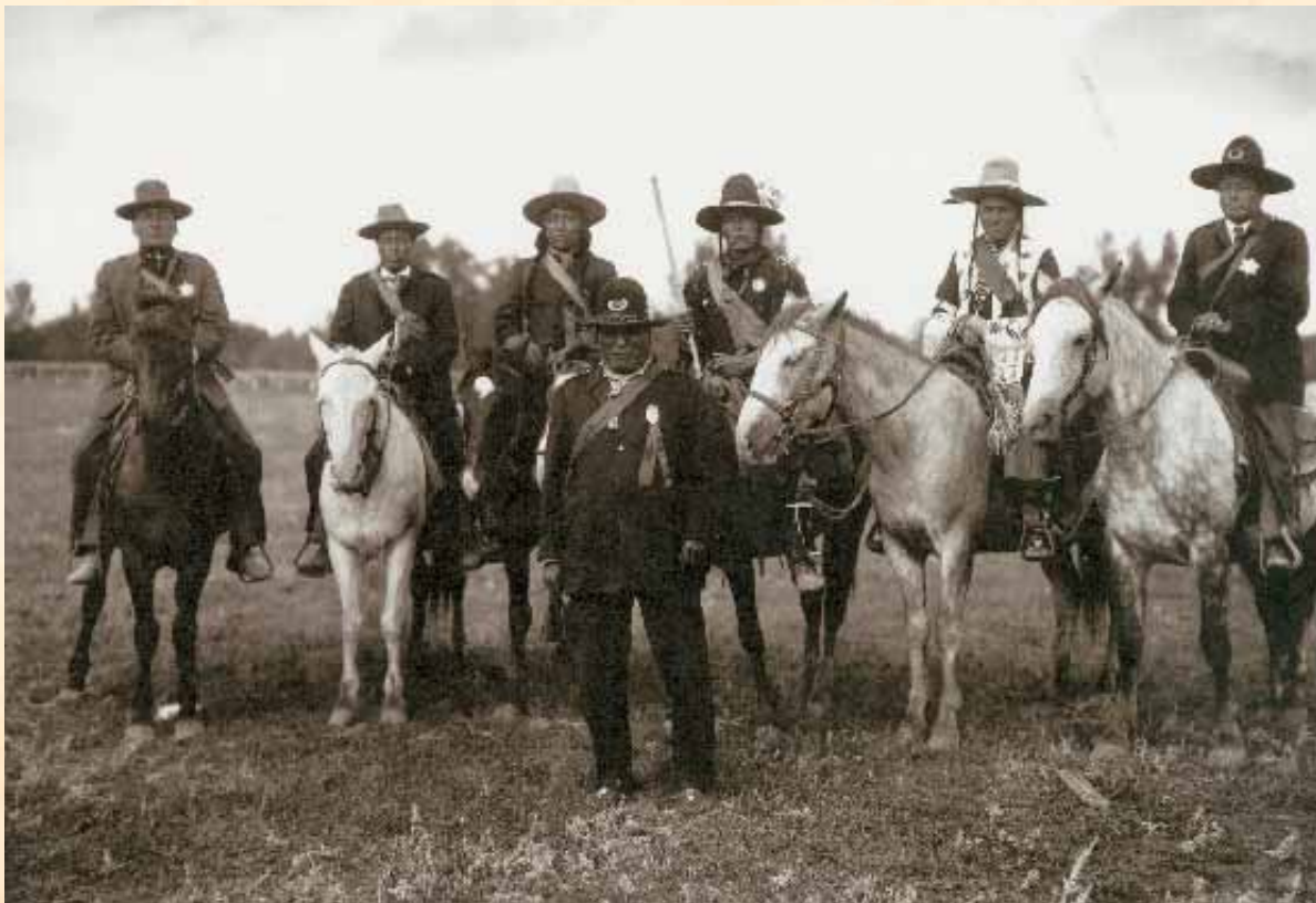
Crow Police, c. 1905-1911