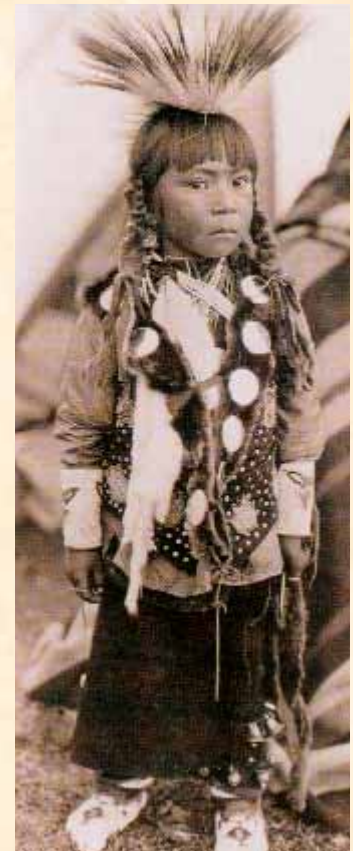
Nez Perce child