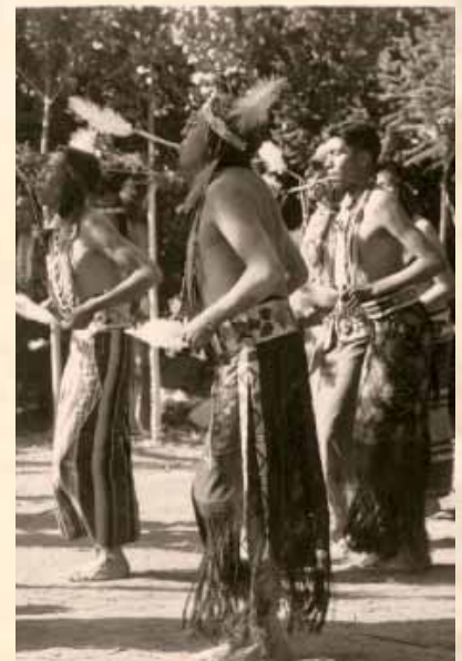
Crow sun dancers, 1941